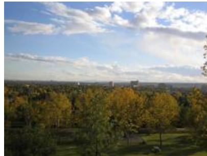
(b) Pan ma signo.