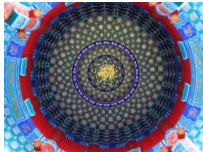
(d) Titulo debitas.