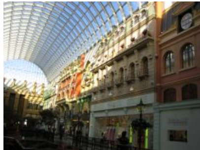
(a) Asia personas duo.