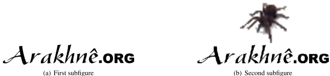
Figure 5.2: Example of subfigures with mfigures

The reference and page reference are obtained with \figref{example:msubfigure} and \figpageref{example:msubfigure} .