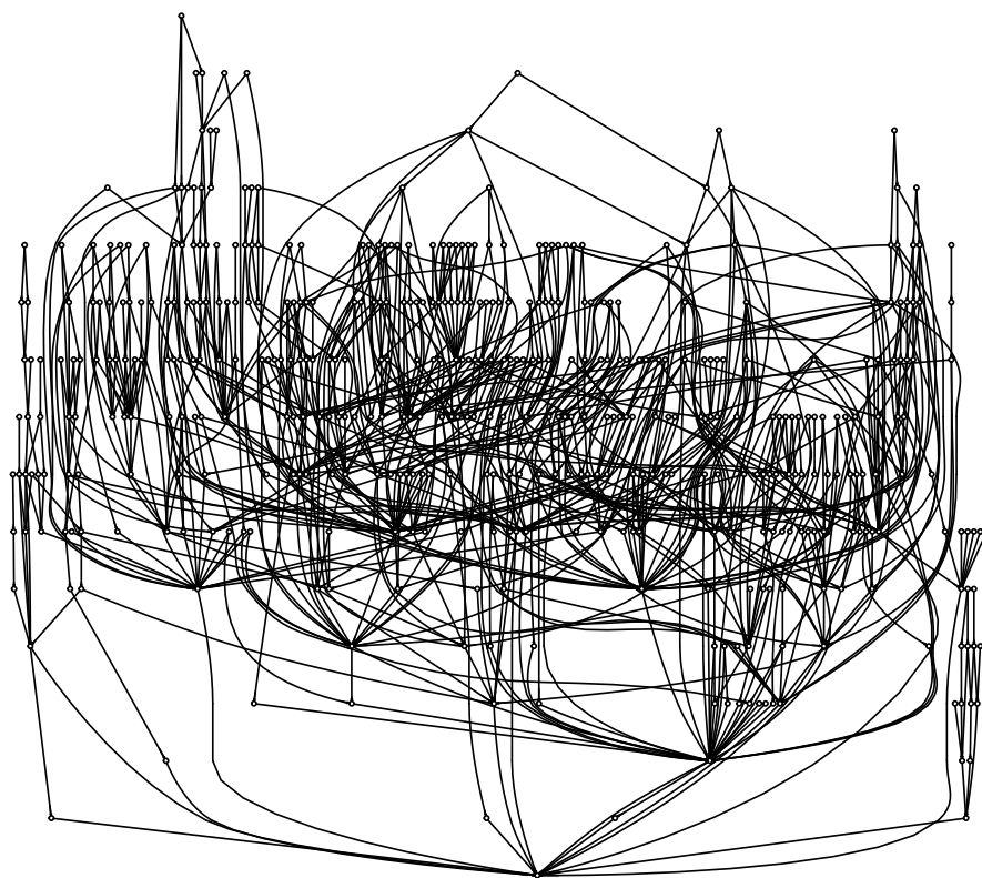
Figure 3: The induced CC GO graph for the selected genes.